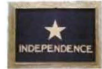
TEXAS INDEPENDENCE FLAG