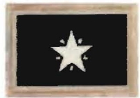
UNOFFICIAL DeZAVALA VARIATION FLAG;